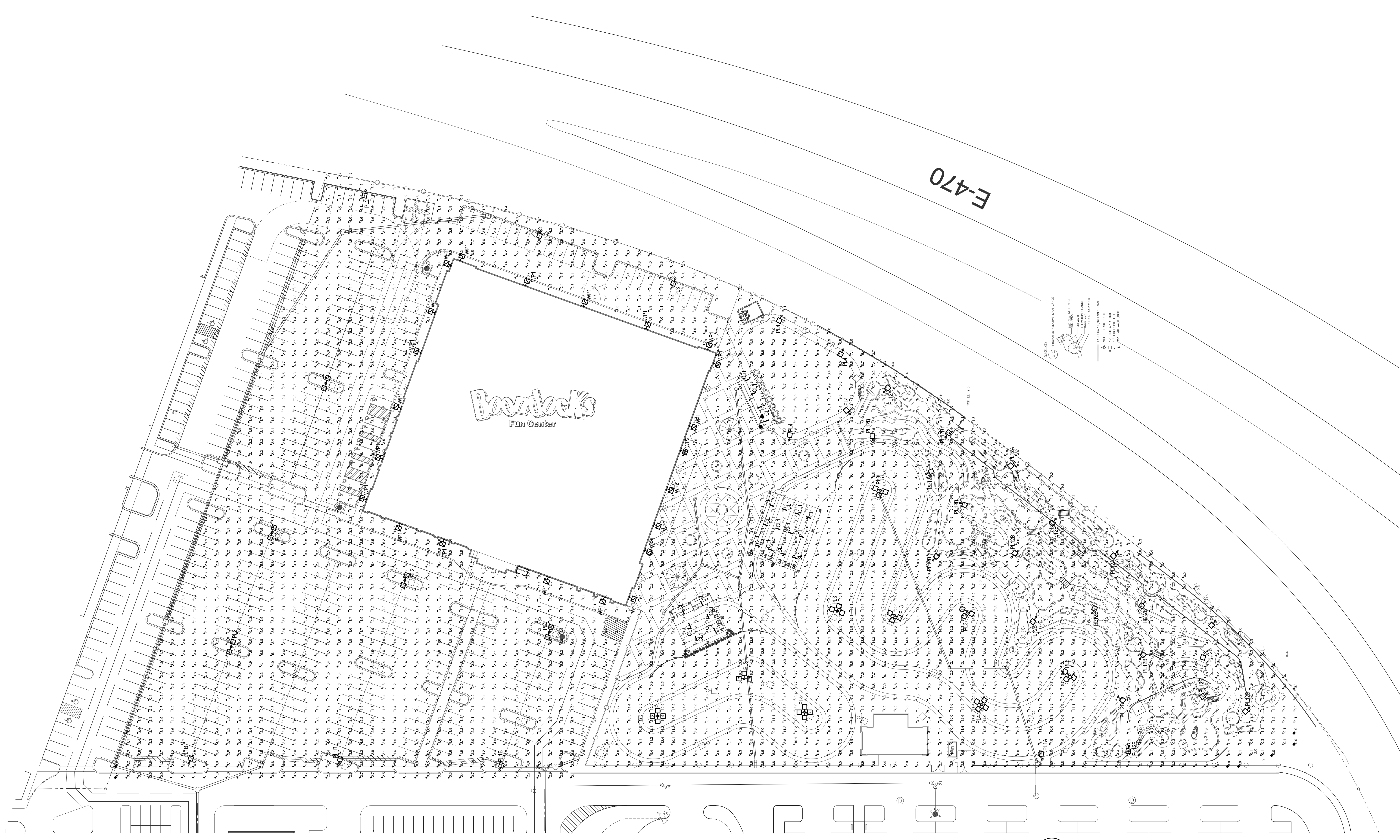
SITE PHOTOMETRIC PLAN NORTH SCALE 1" = 40'-0"

Peter H. Rockwell, Architect Architecture • Planning 595 S Americana Boulevard Boise, Idaho 83702 (208) 345-0566 (208) 345-1718 Fax (208) 387-0889 office@pgrboise.com