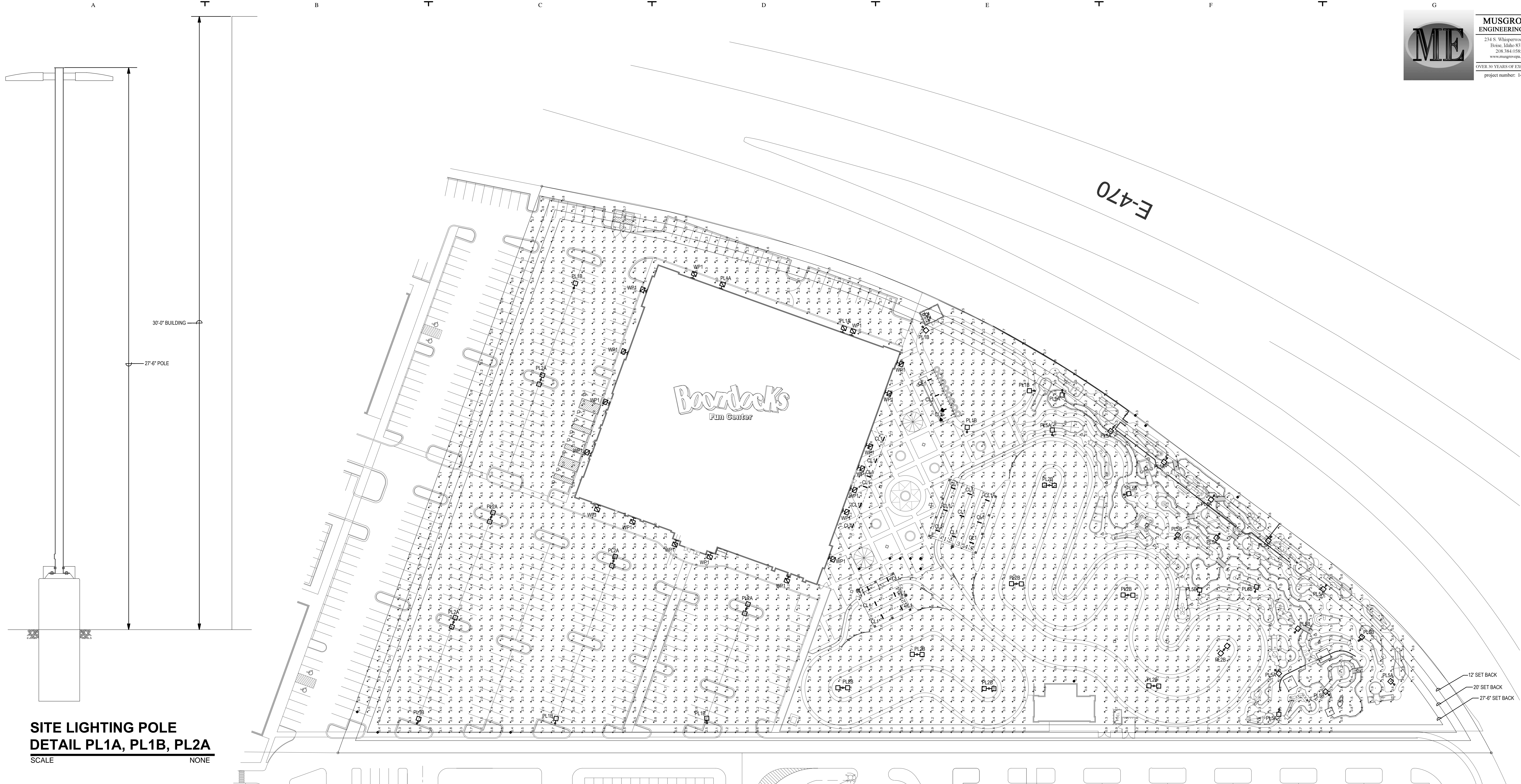
SITE LIGHTING POLE DETAIL PL1A, PL1B, PL2A SCALE NONE