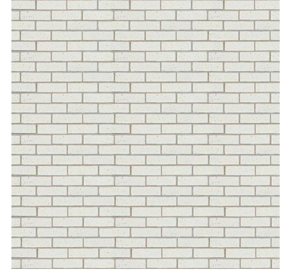
⑤ BRICK VENEER - 'ARCTIC WHITE' BY INTERSTATE

ARCHITECTURAL SAMPLE BOARD MURPHY EXPRESS 12405 SOUTH PARKER ROAD PARKER COLORADO