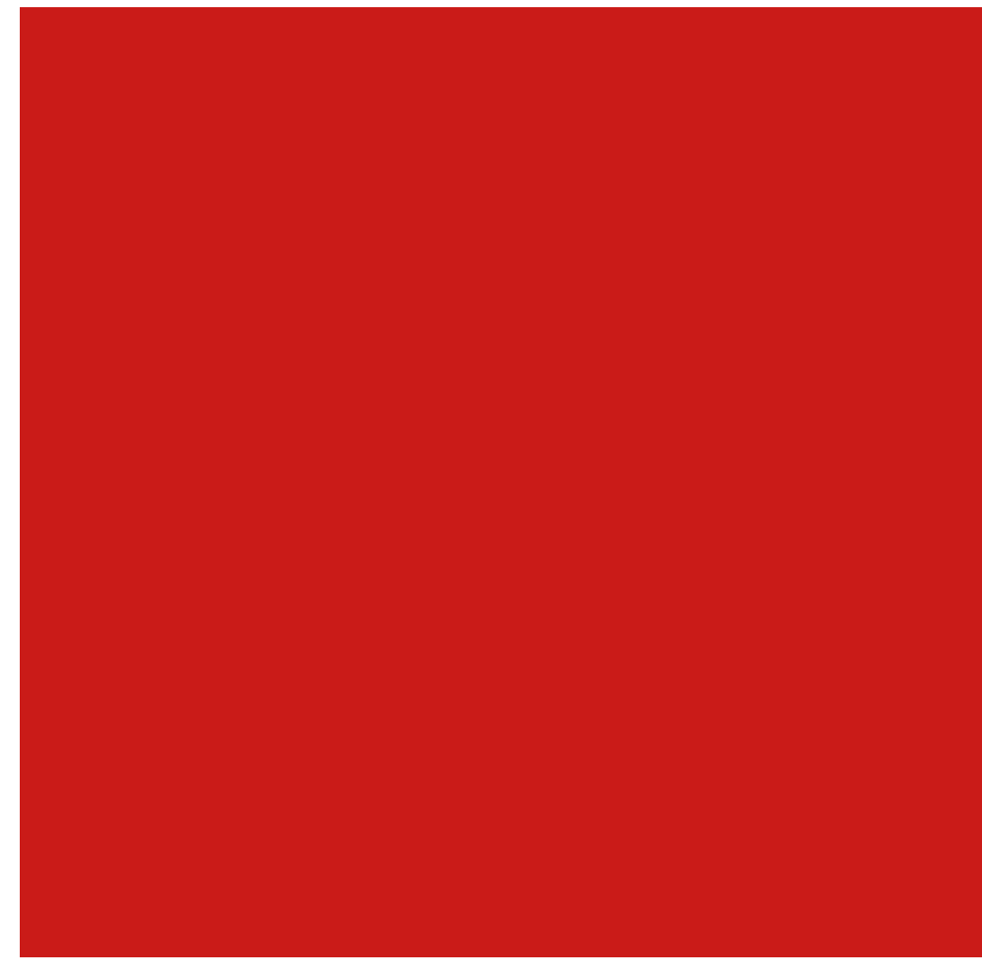
③ ACM - 'PROGRAM RED' BY ALPOLIC