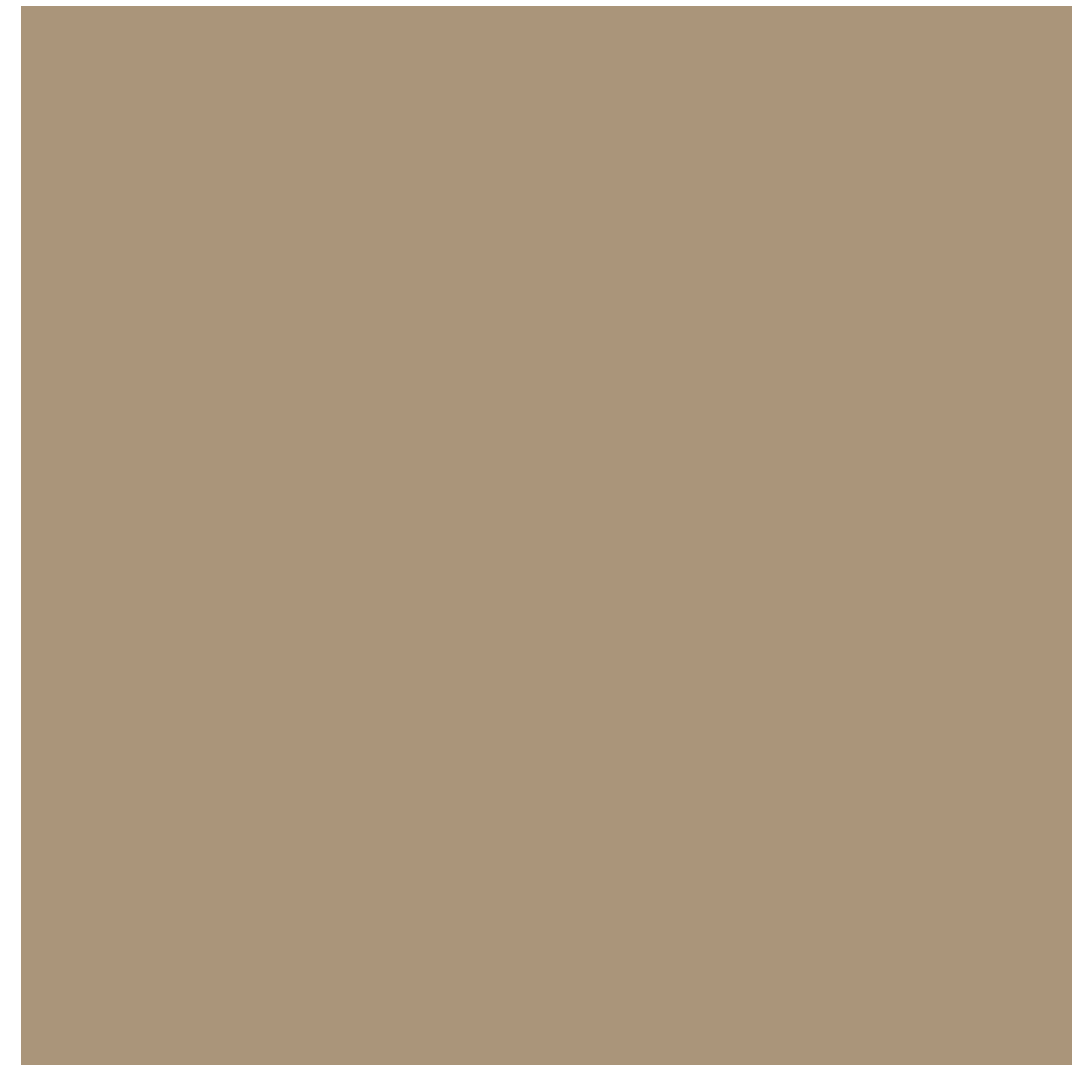
② ACM / METAL - 'DORMER BROWN' SW #7521