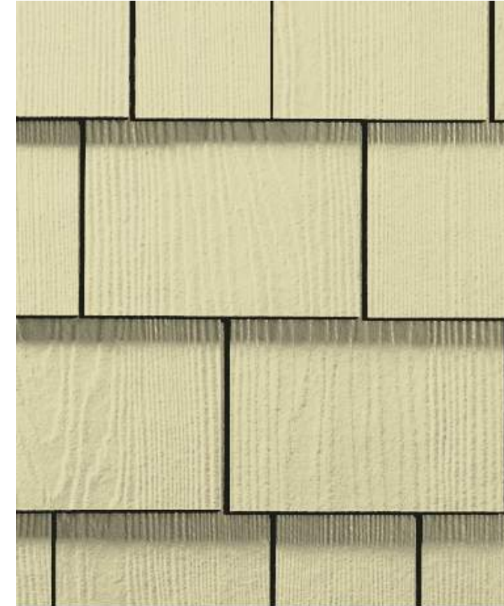
WOOD SHAKE SIDING - HARDIESHINGLE - STRAIGHT EDGE PANEL 'NAVAJO BEIGE' BY JAMES HARDIE