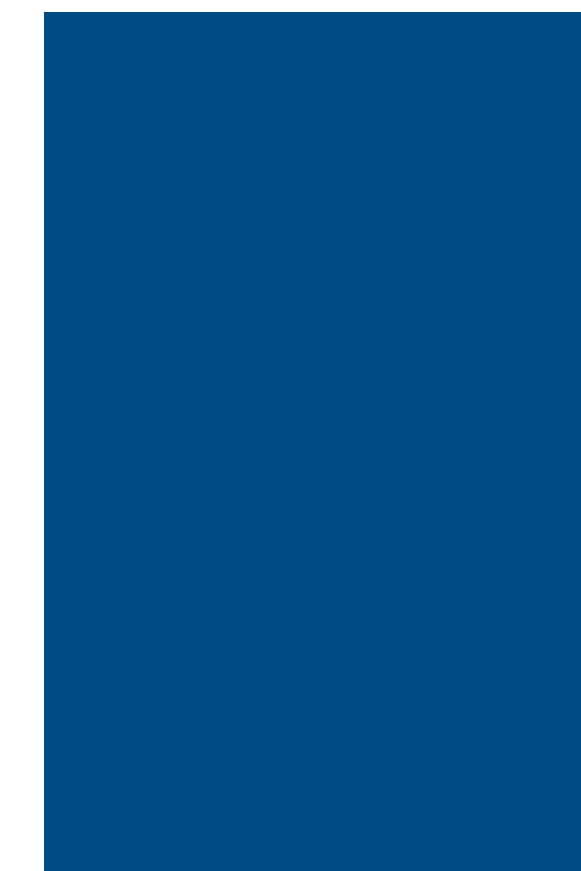
COMPOSITE WOOD TRIM ( LIMITED LOCATIONS ) - PAINT 'BLUE'