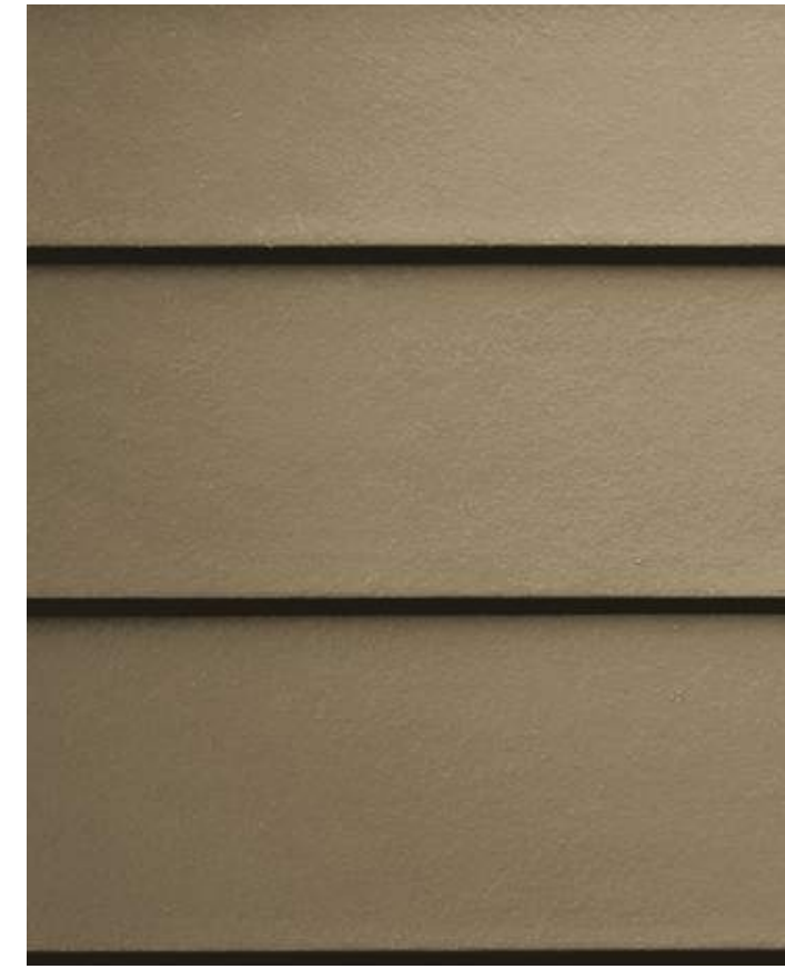
HORIZONTAL SIDING - HARDIEPLANK - SMOOTH - 'KHAKI BROWN' BY JAMES HARDIE