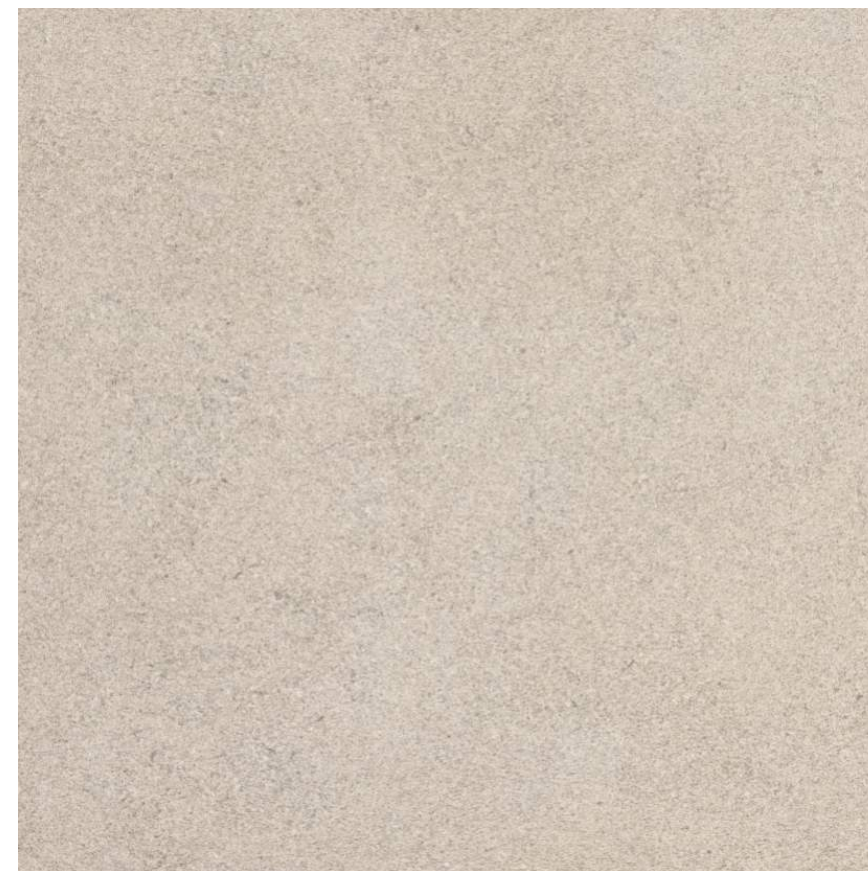
ARCHITECTURAL PRECAST CONCRETE - INDIANA LIMESTONE