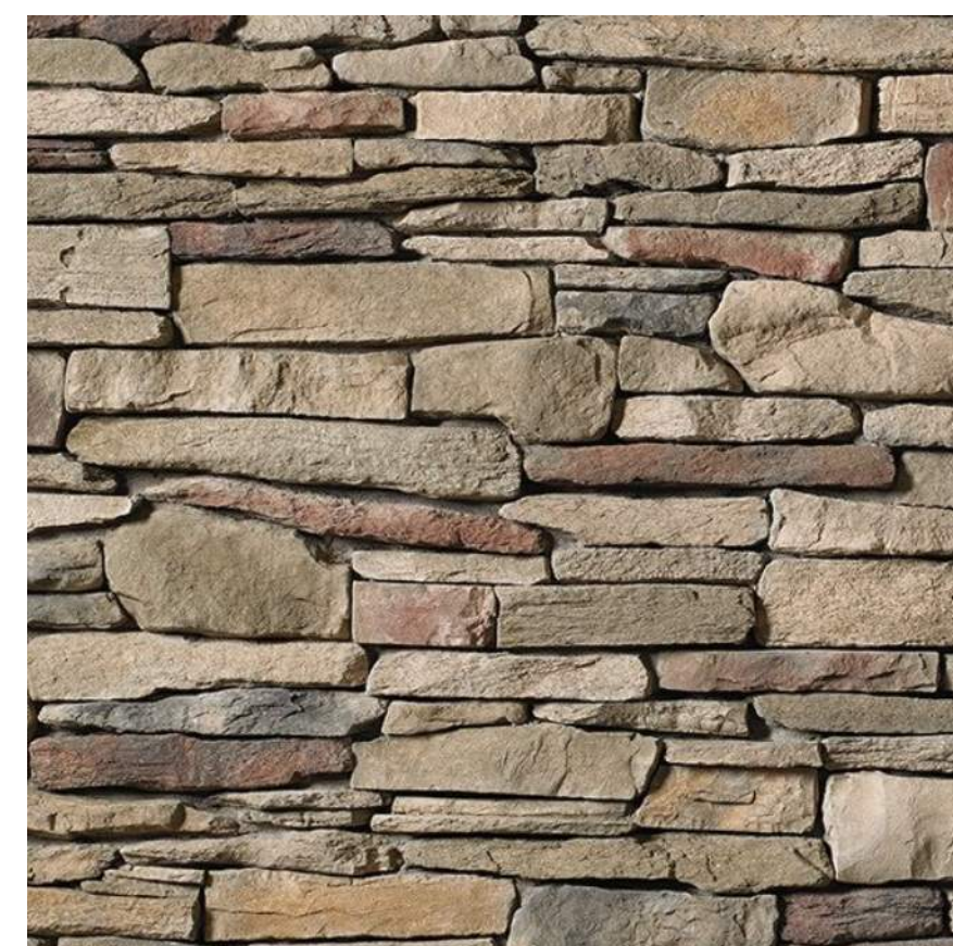
STONE VENEER - SOUTHER LEDGESTONE 'CHARDONNAY' BY CULTURED STONE