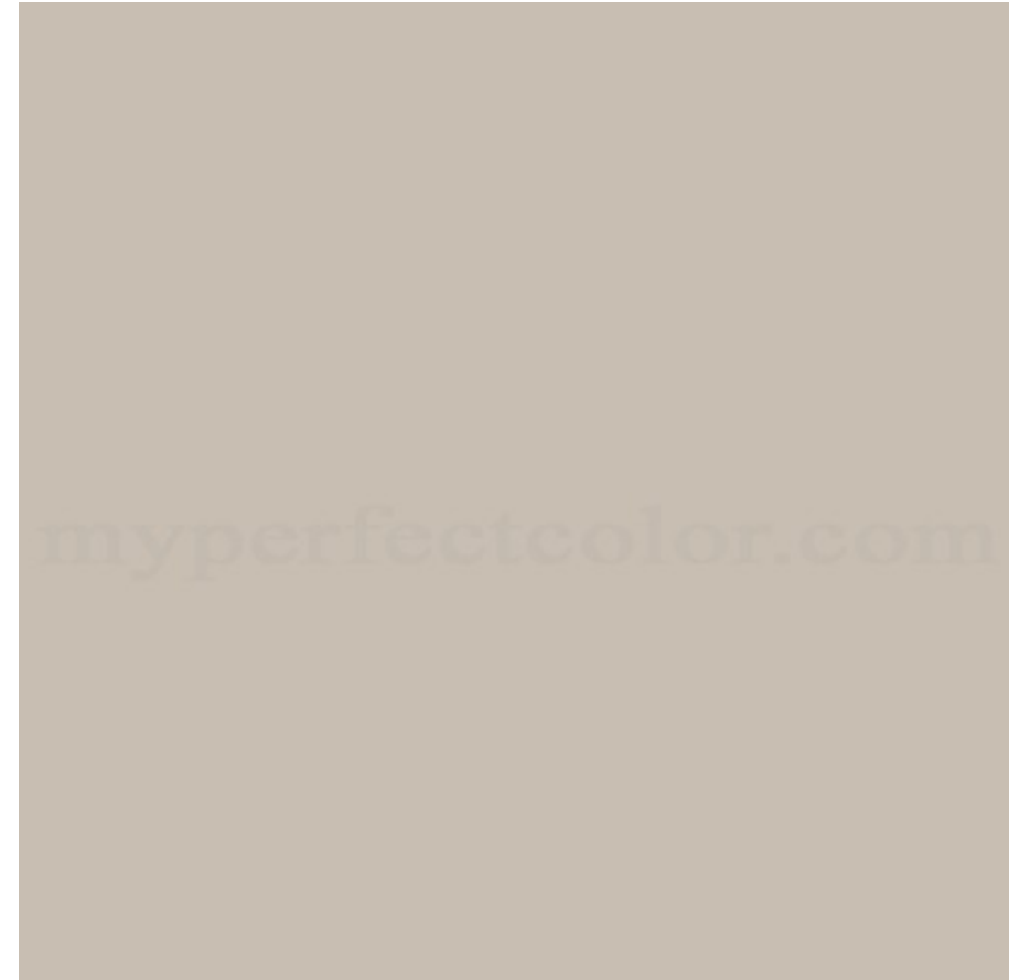
BOARD AND BATTEN SIDING - HARDIEPANEL VERTICAL SIDING - 'COBBLE STONE' WITH HARDIETRIM BOARD - SMOOTH BATTEN BOARD - 'COBBLE STONE' BY JAMES HARDIE