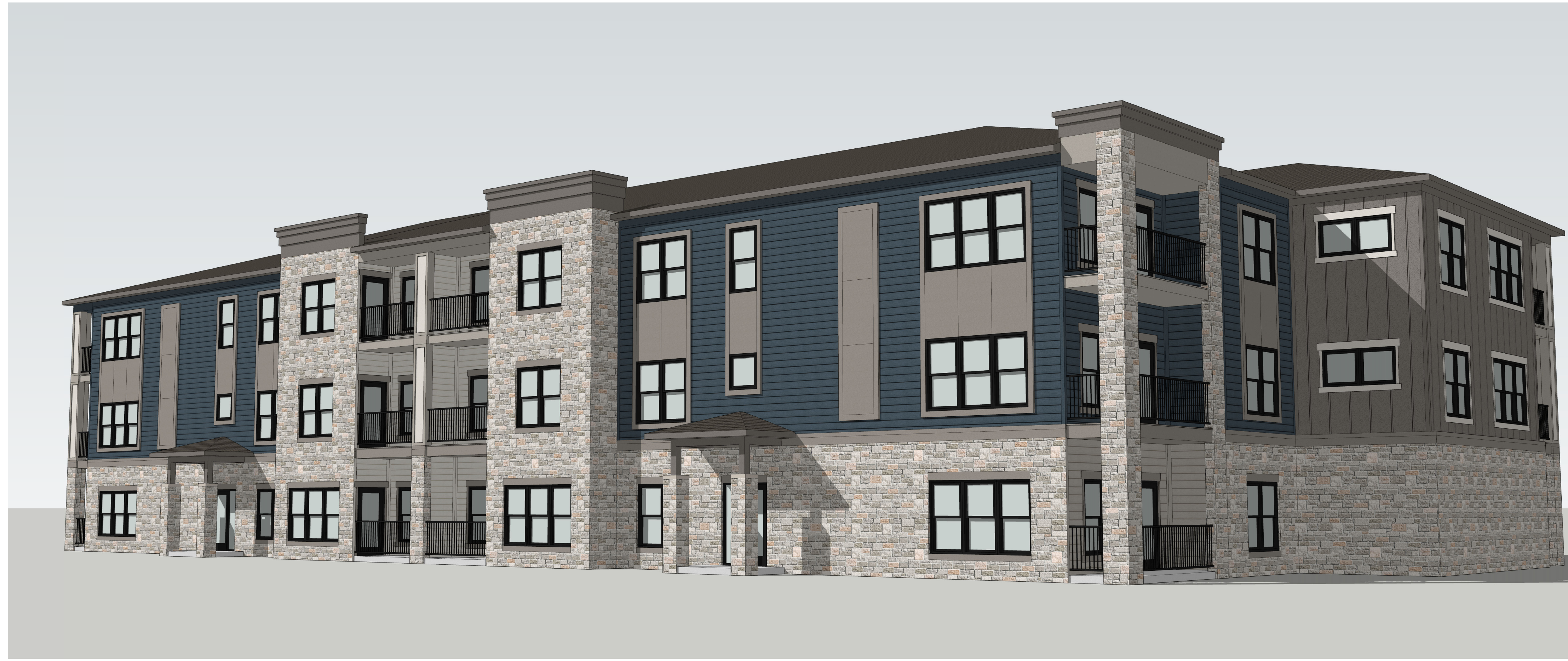
2 BUILDING 1 PERSPECTIVE NTS