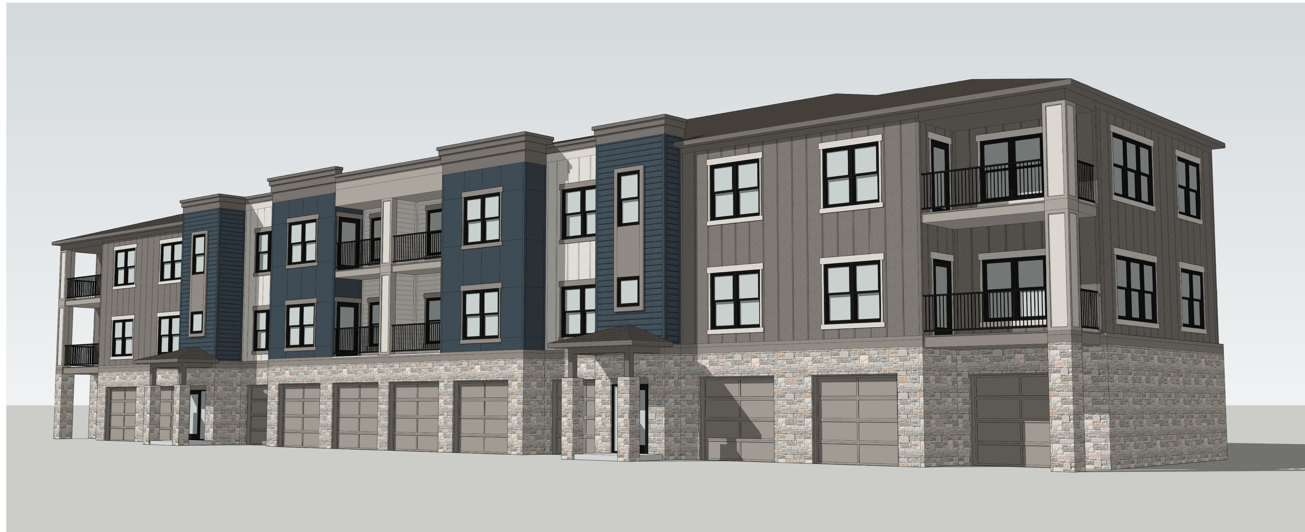
1 BUILDING 1 PERSPECTIVE NTS

SEBREE Architects, Inc. 97 Dover Street, Suite 400, Avon, Indiana 46123-7356 Phone (317) 272-7800 FAX (317) 272-7808 Web Site: http://www.sebreearchitects.com