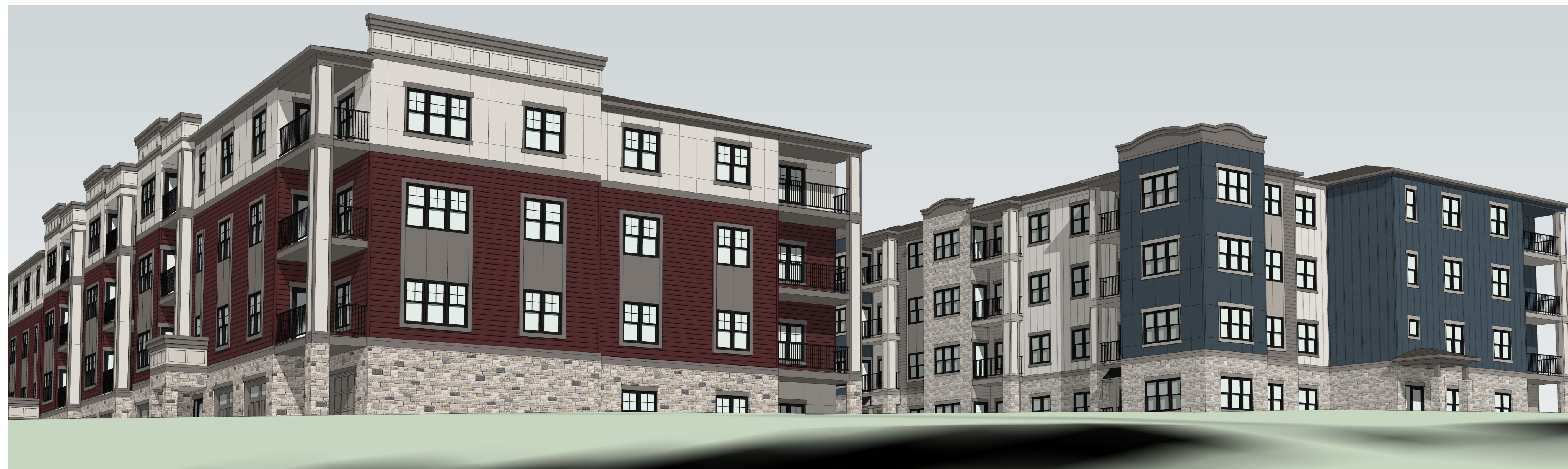
1 BUILDINGS 2 & 3 VIEW FROM TRAIL NTS

SEBREE Architects, Inc. 97 Dover Street, Suite 400, Avon, Indiana 46123-7356 Phone (317) 272-7800 FAX (317) 272-7808 Web Site: http://www.sebreearchitects.com