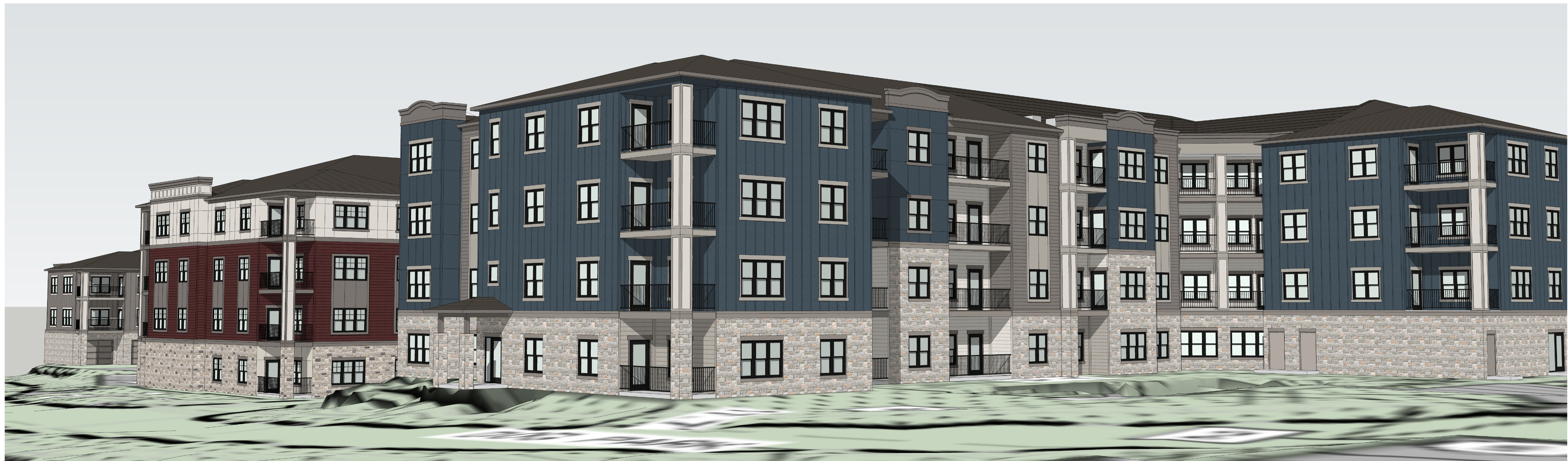
1 BUILDINGS 1, 2 & 3 VIEW FROM LOT 3 NTS

SEBREE Architects, Inc. 97 Dover Street, Suite 400, Avon, Indiana 46123-7356 Phone (317) 272-7800 FAX (317) 272-7808 Web Site: http://www.sebreearchitects.com