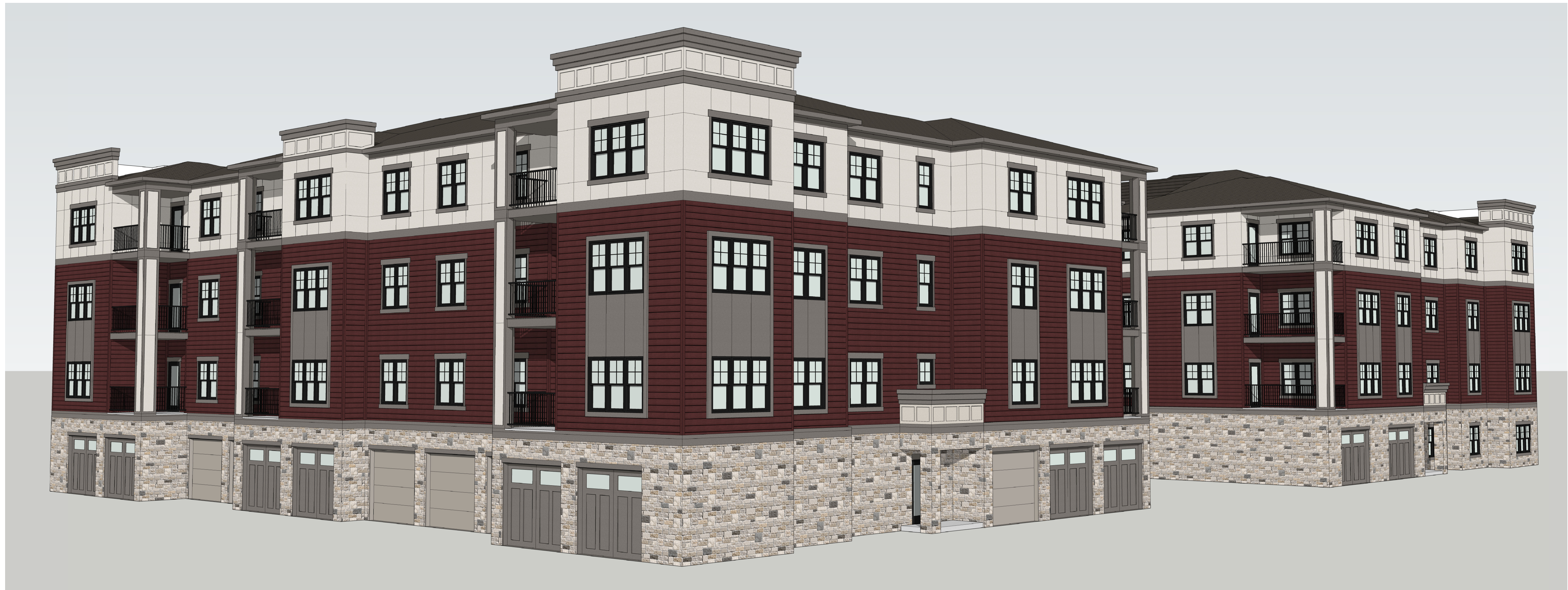
1 BUILDING 4 PERSPECTIVE NTS

SEBREE Architects, Inc. 97 Dover Street, Suite 400, Avon, Indiana 46123-7356 Phone (317) 272-7800 FAX (317) 272-7808 Web Site: http://www.sebreearchitects.com THESE PLANS AND SPECIFICATIONS ARE PROTECTED UNDER FEDERAL COPYRIGHT LAWS. © SEBREE ARCHITECTS, INC. ALL RIGHTS RESERVED.