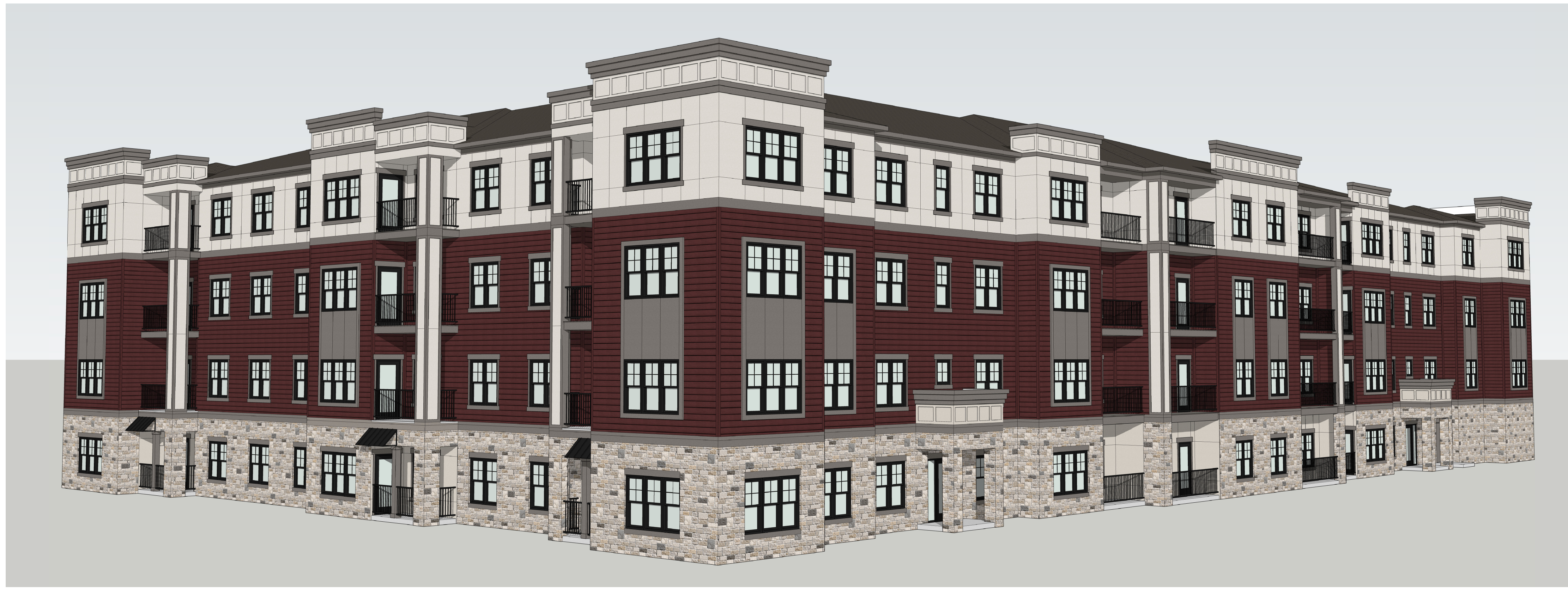
2 BUILDING 4 PERSPECTIVE NTS

NOTE: THE ELEVATIONS ARE IN COMPLIANCE WITH THE PARKER AND PINE MIXED-USE DEVELOPMENT DESIGN STANDARDS.