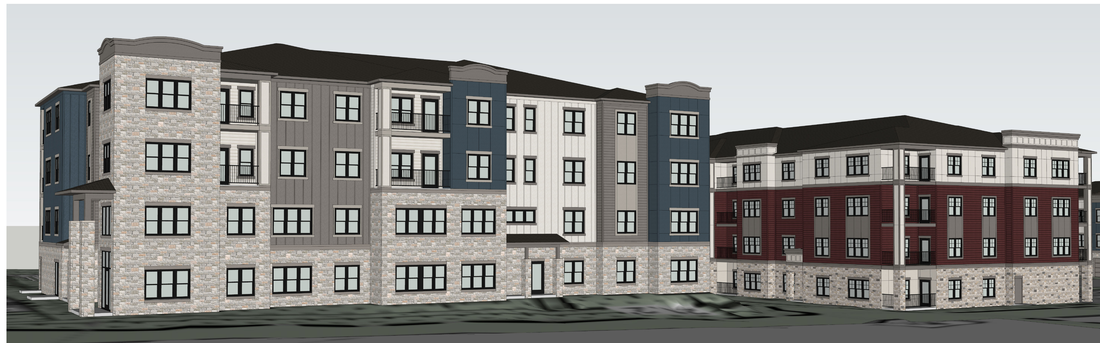
3 BUILDINGS 2 & 3 VIEW FROM NORTH