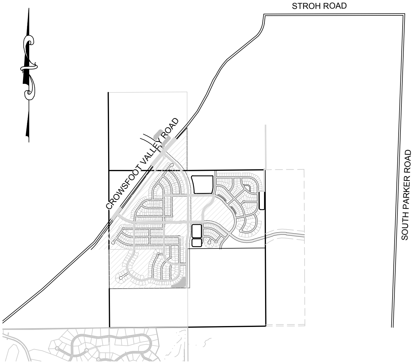
EXHIBIT E – FILING 1 VICINITY MAP