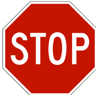
30" w x 30" h R1-1 .080 Aluminum High Intensity Prismatic White on Red