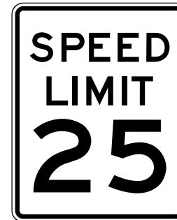
24" w x 30" h R2-1(25) Qty-4 .080 Aluminum High Intensity Prismatic Black on White