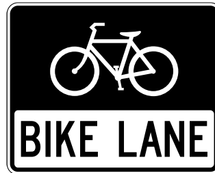
30" w x 24" h R3-17 Qty-8 .080 Aluminum High Intensity Prismatic Black on White