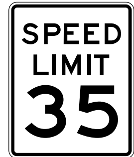
24" w x 30" h R2-1(35) Qty-5 .080 Aluminum High Intensity Prismatic Black on White