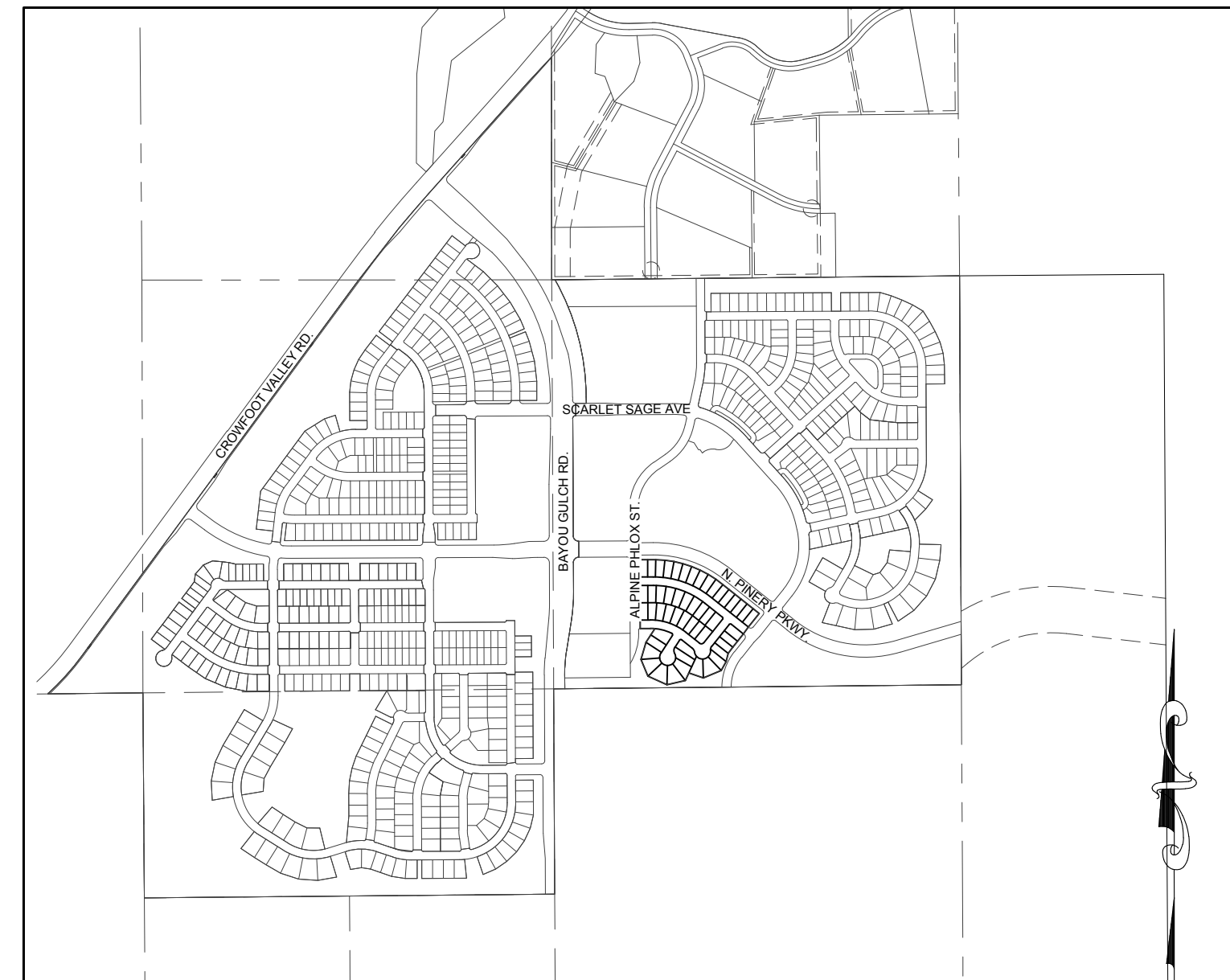
VICINITY MAP SCALE: 1" = 1000'

MY COMMISSION EXPIRES _____ NOTARY PUBLIC _____