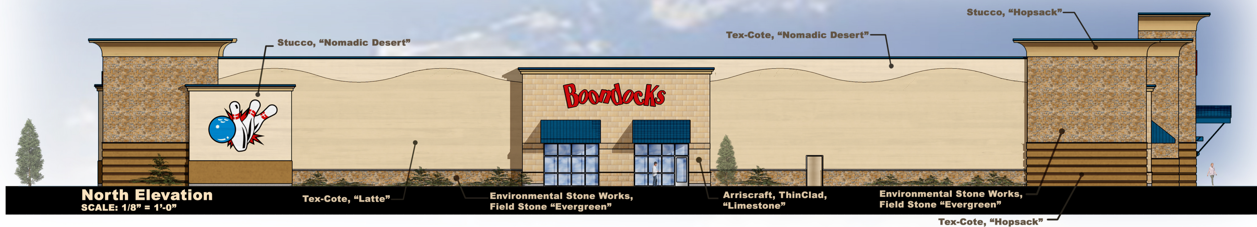
North Elevation SCALE: 1/8" = 1'-0"