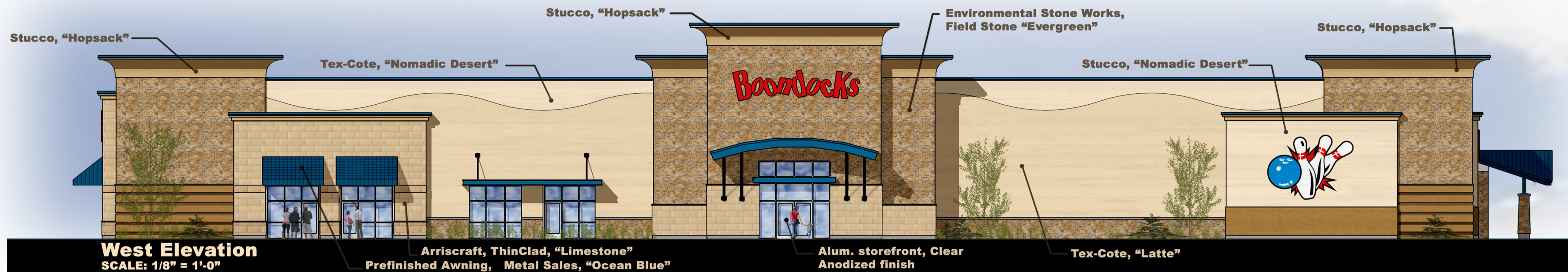
West Elevation SCALE: 1/8" = 1'-0"