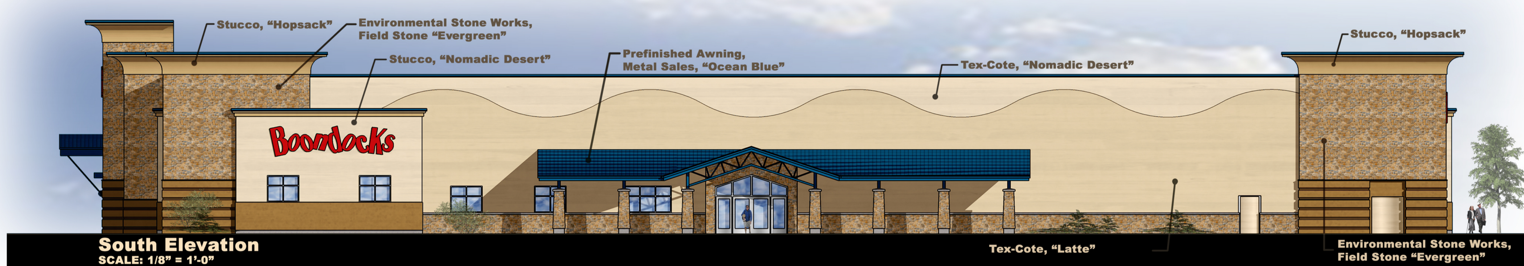
South Elevation SCALE: 1/8" = 1'-0"